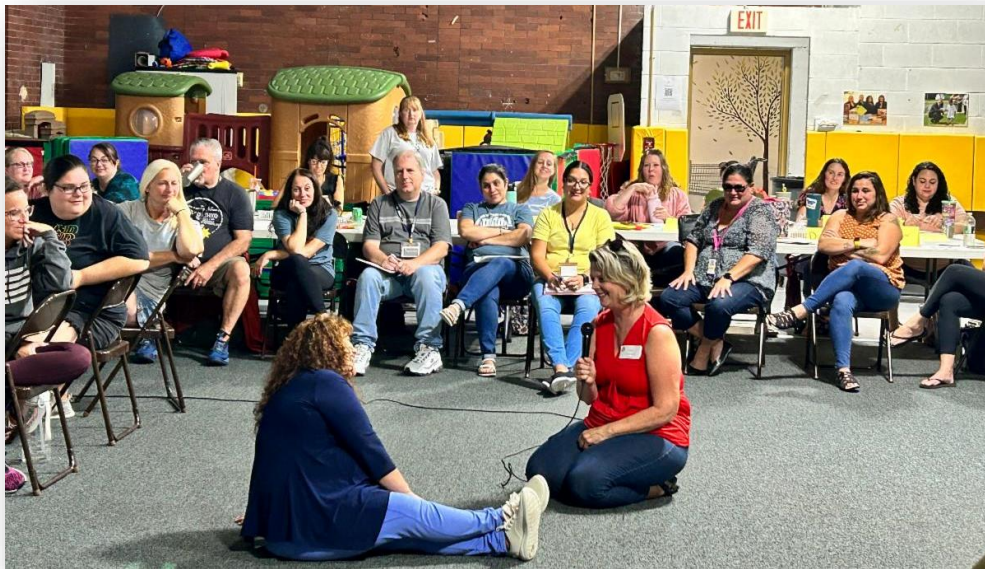
The CI team consults with and provides professional development to child-serving professionals.

To learn more about CI, visit its website , including its executive summary document , strategic plan overview video , and blog .