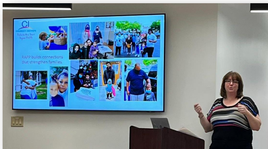
A program lead for RAPP (CI's Rochester Area Parent Program) presents at a CI staff meeting.